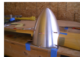
New Prop & Spinner – Before & After